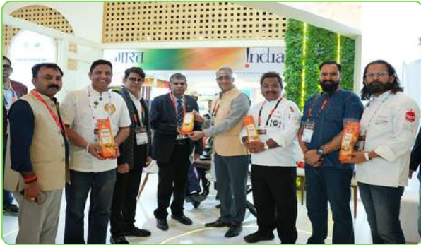
New products of Just Organic Brand

New Products of few companies were launched during the event at APEDA pavilion. These product launches reinforced India's transition from bulk agri-commodity supplier to premium, innovation-led food brand destination.