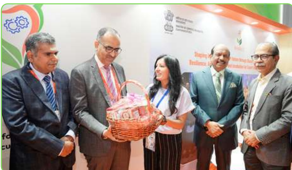
Product launch of Burgandy Bagh Tea brand from Madhya Pradesh