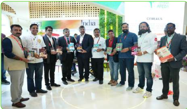
Products of Aahara brand