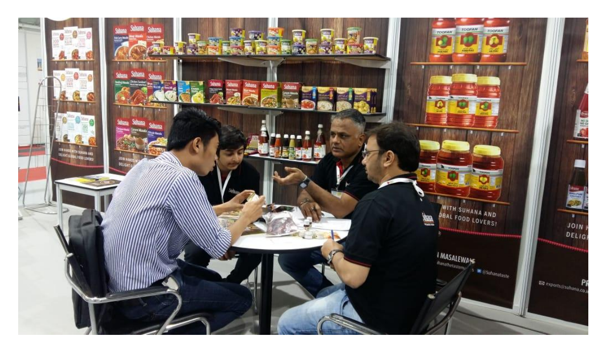
Details of potential buyers visited APEDA pavillion during the event