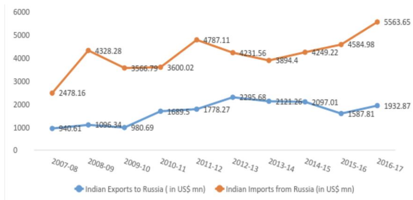
Figure 1: India’s Trade with Russia (in US$ Millions)