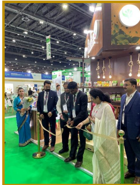
Shri Satish Kumar Sivan Cutting the Ribbon to inaugurate India Pavilion

The showcased products included Organic rice, cereals, oils, herbs, seeds, mango pulps and dehydrated vegetables and fruits.