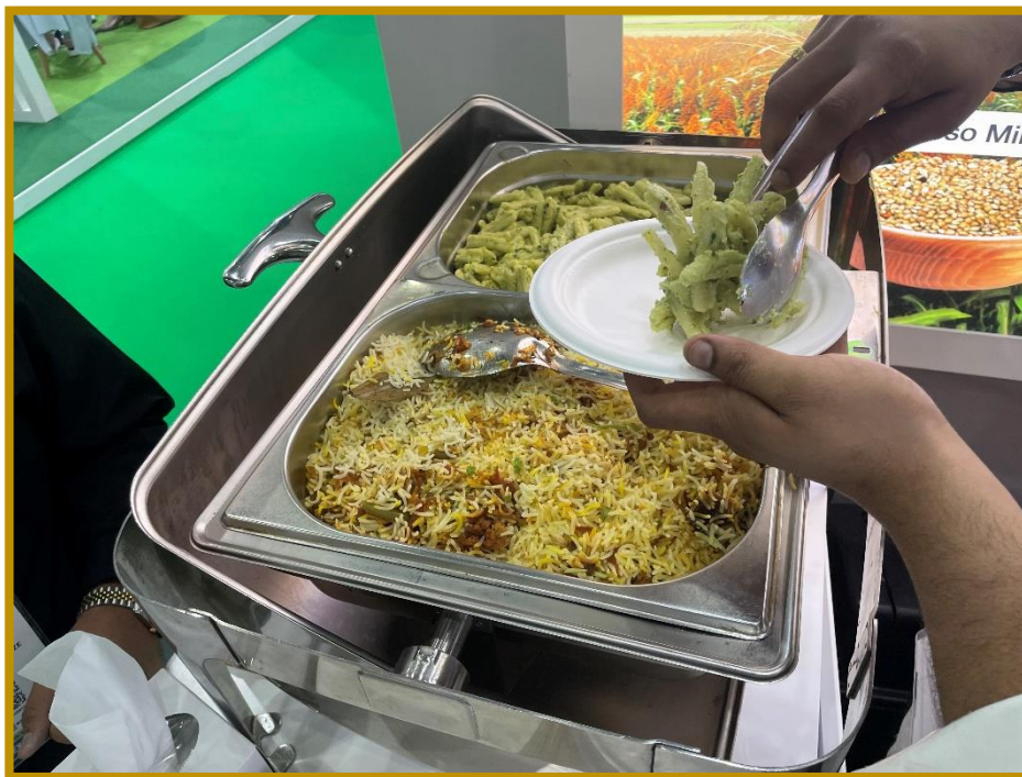
THE ZAFARANI SUBZ PULAO, ORGANIC MILLET KHICHDI & ORGANIC PASTA BEING SAMPLED