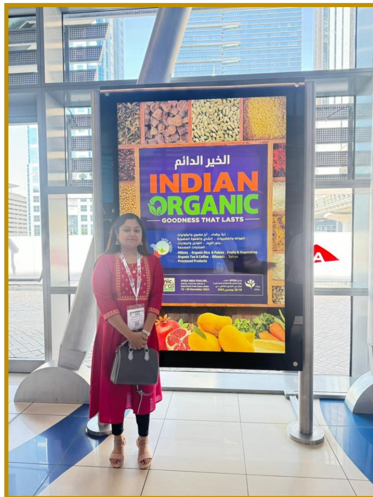
DUBAI METRO STATION

Print Media Campaign “INDIAN ORGANIC – GOODNES THAT LASTS” was also run.