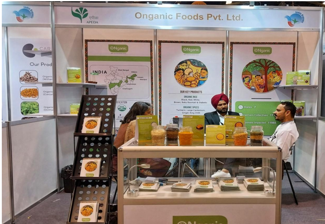
(M/S. ONGANIC FOODS PVT. LTD.)