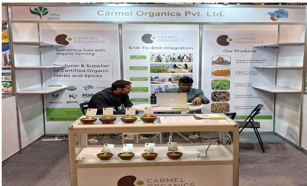
(M/S. CARMEL ORGANICS PVT. LTD.)