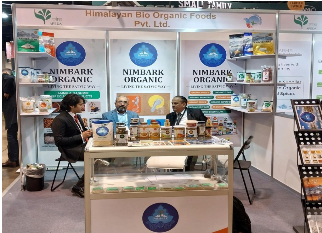
(M/S. HIMALAYAN BIO ORGANIC FOODS PVT. LTD.)