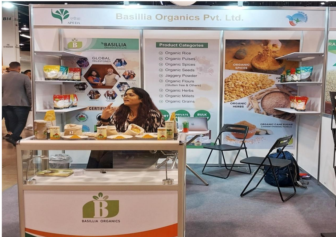
(M/S. BASILLIA ORGANICS PVT. LTD.)