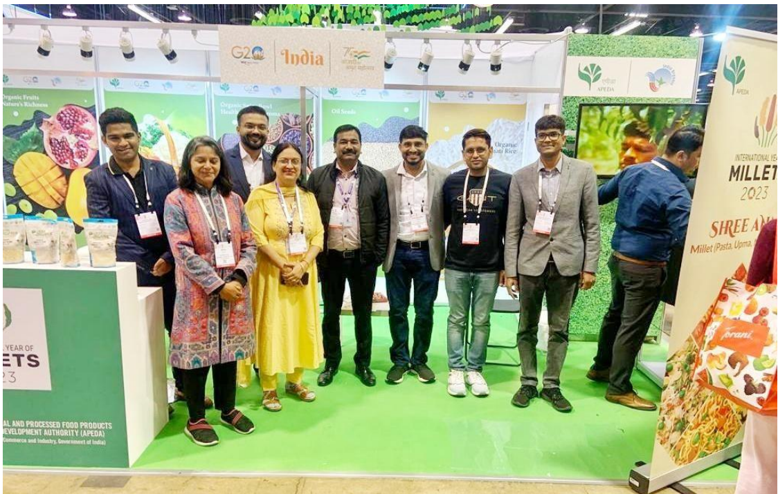
EXHIBITORS AT APEDA INDIA PAVILION