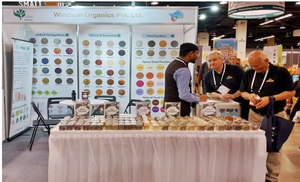
(M/S. WINDSON ORGANICS PVT. LTD.)