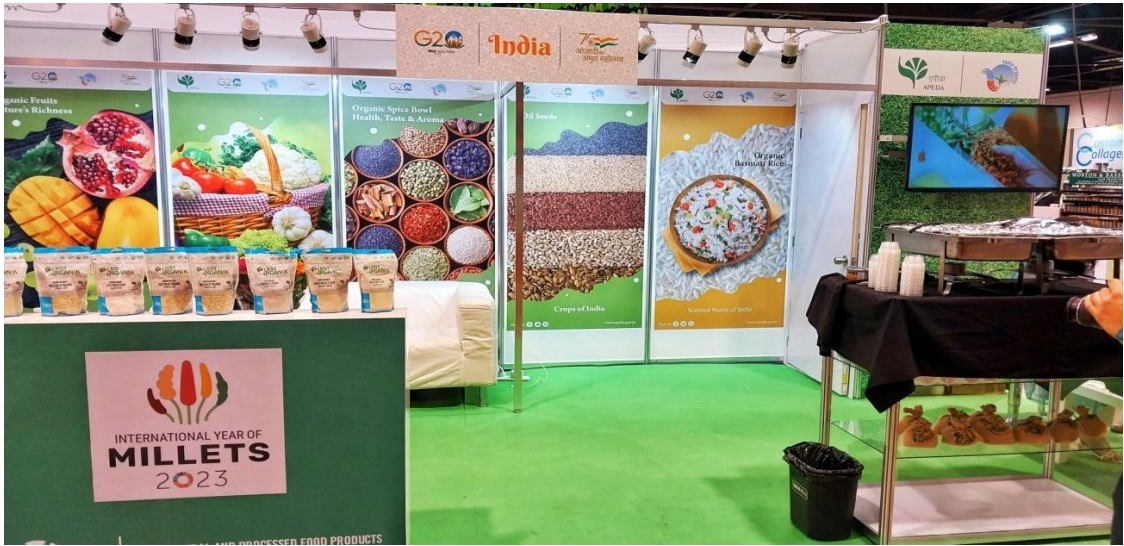
APEDA INDIA PAVILION