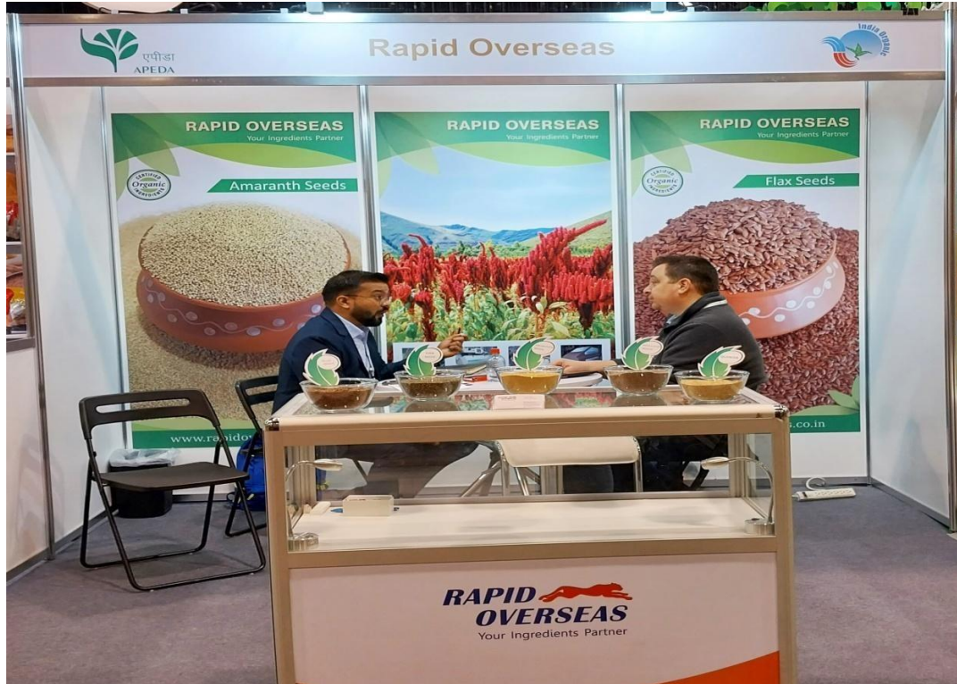
(M/S. RAPID OVERSEAS)