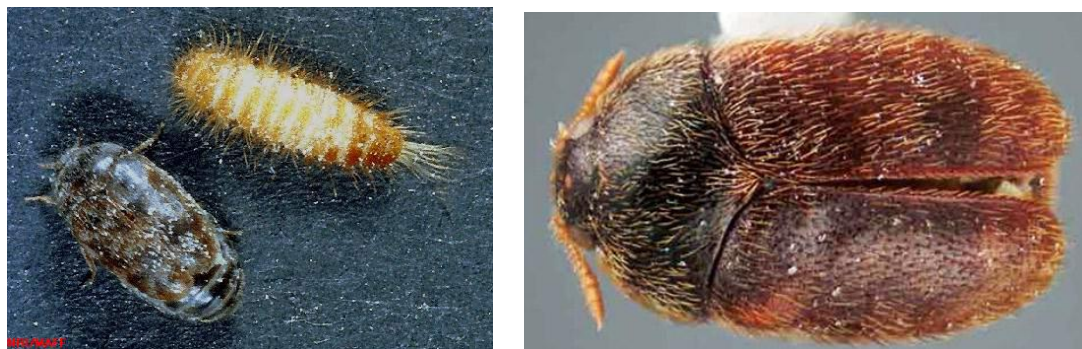
Fig: Adult & Larva of T. granarium

Khapra beetle is voracious feeder of peanut and belongs to Coleoptera: Dermestidae. The most likely stage to be seen during inspection is the larval stage and the most usual evidence is castings larval skin in the consignment. In warehouses cracks and crevices to be examined and inspect hidden/ undisturbed places.