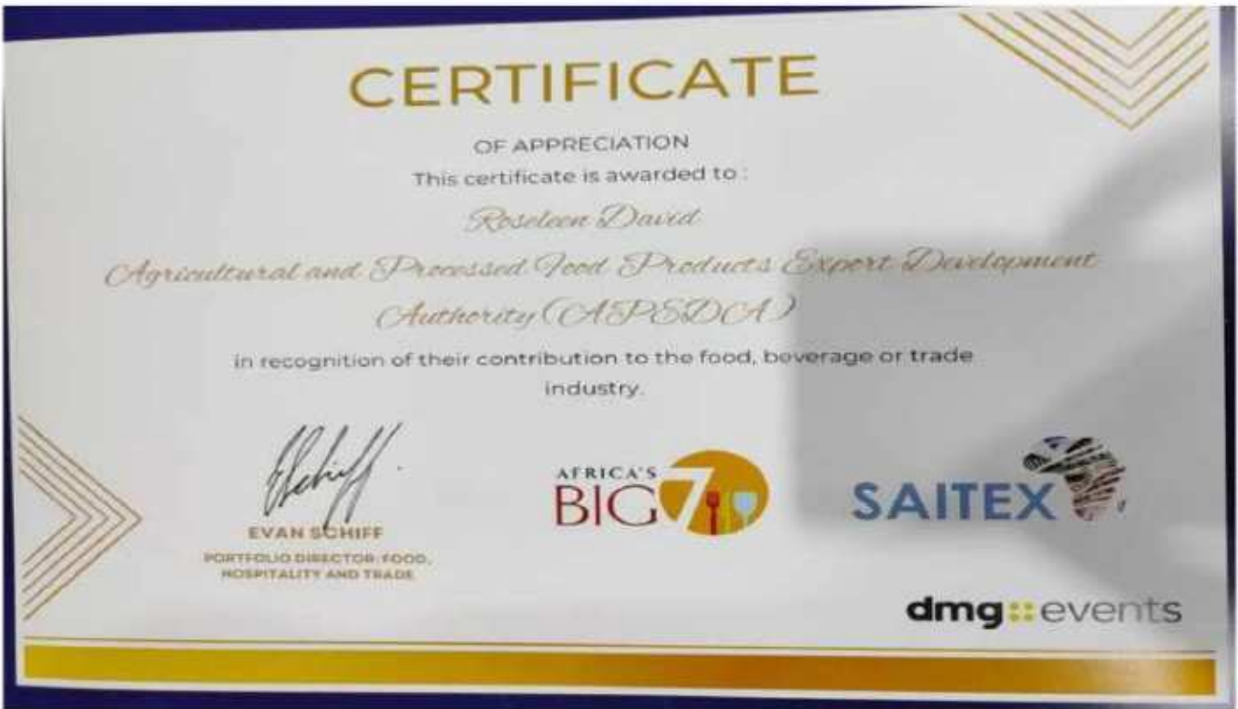
Closed Down the Event with Award of Certificate