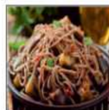
Ragi Noodles Mix