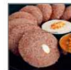
Ragi Idli Mix