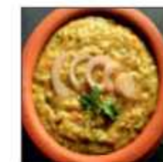
Bajra Khichdi Mix