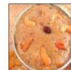
Multimillet Sweet Mix