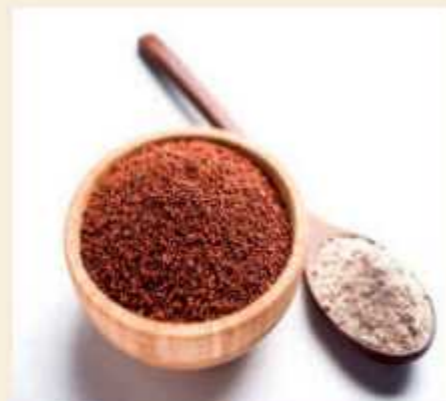
TABLE 5: FINGER MILLET NUTRIENT PER 100GMS

Another significant staple grain in Eastern Africa and Asia is finger millet ( Eleusine coracana ), often known as ragi in India (India, Nepal). At the top of the stem, the plant has many spikes or "fingers." The grains are tiny (1-2 mm in diameter). Finger millet grains are rich in minerals, dietary fibre, polyphenols, and proteins. Finger millet, which is rich in calcium plays an important role in growing children, pregnant women as well as people suffering from obesity, diabetes and malnutrition. It contains high amount of potassium for the proper functioning of the kidneys and brains and allows the brain and muscles to work smoothly.