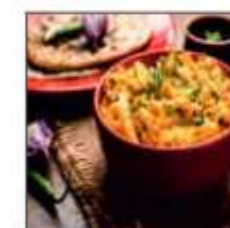
Jowar Khichdi Mix