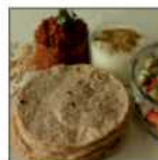
Jowar Chapati Mix