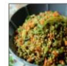
Jowar Upma Mix