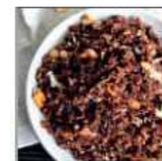
Ragi Upma Mix