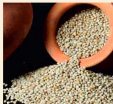
TABLE 1: PEARL MILLET NUTRIENT PER 100 GMS

The most extensively cultivated millet is pearl millet ( Pennisetum glaucum , P. typhoides , P. typhipideum , and P. americanum ). Large stems, leaves, and heads characterise this summer cereal grass. In terms of farmed land and contributions to food security in parts of Africa and Asia that can only produce limited amounts of other crops, pearl millet is the most significant species of millet. Compared to other millet such as sorghum or maize, it utilizes moisture more effectively. Condensed panicles (spiked) measuring 10 to 150 cm in length, support the grain. Under conditions of heat and drought, pearl millet has the highest yield potential of all millets. Pearl millet can be beneficial in the process of weight loss as it is high in fiber content and also give satiety as it takes a longer time to pass through the stomach to the intestine. It has been found that due to its high fibre content risk of occurrence of gall stone is low. Pearl millet had phosphorus and a rich source of calcium which helps to attain peak bone density