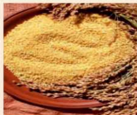
TABLE 7: NUTRITIVE VALUES PER 100GMS

Little Millet ( Panicum miliare ) is one among the minor millets grown to a limited extent all over India up to altitudes of 2100 m. It is a relative of proso millet but the seeds of little millet are much smaller than proso millet, with their low carbohydrate content, slow digestibility and low water-soluble gum content. The complex carbohydrates, phenolic compounds, antioxidant content present in them helps to prevent metabolic disorders like diabetes, cancer, obesity etc.