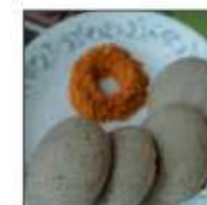
Jowar Idli Mix