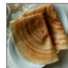
Jowar Dosa Mix