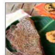
Ragi Dosa Mix