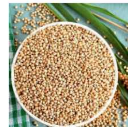
TABLE 4: PRODUCTION OF SORGHUM IN INDIA