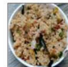
Bajra Upma Mix