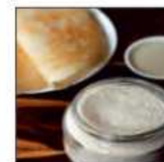
Bajra Dosa Mix